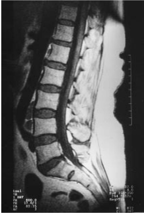
Figure 2. Normal MR findings of bone marrow on T1-weighted images.

ges of that patient were re-evaluated together to reach a final decision.