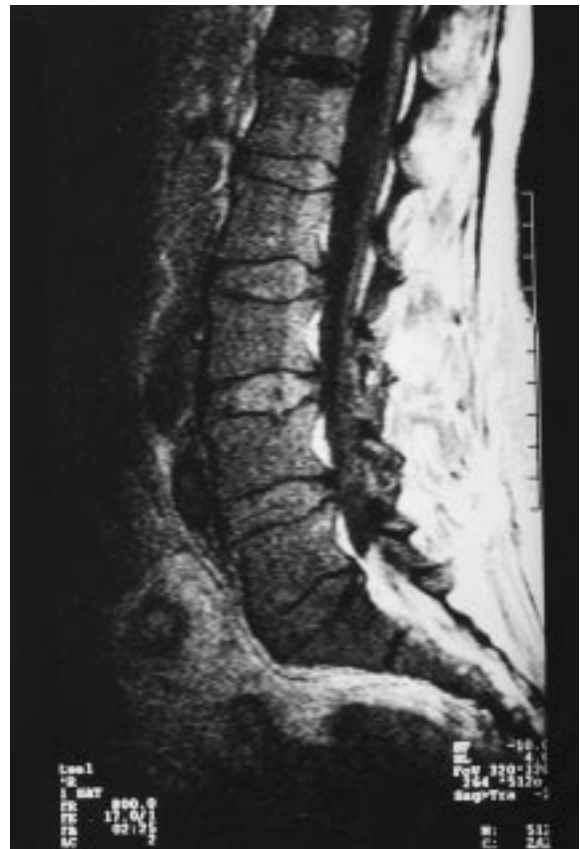
Figure 3. Diffuse signal intensity decrease on T1-weighted images due to diffuse bone marrow infiltration in non-Hodgkin's lymphoma.

There are only six patients with HD evaluated. Table 6 shows that half of the patients (3/6) had positive MRI and biopsy results (cases 4,5,6). MRI was negative in another