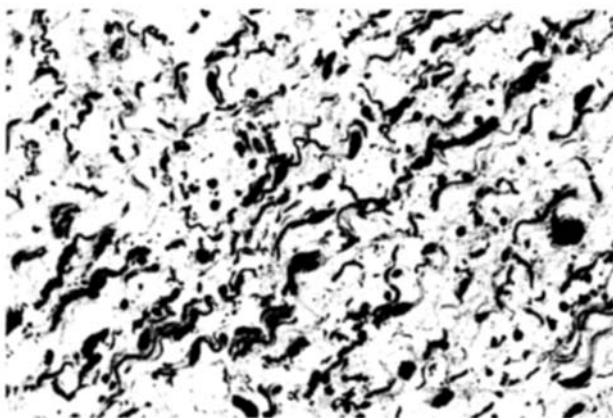
Figure 2. Positive immunoreaction with anti S-100 protein serum of twisted cells (PAP-AEC, 250x).

Gross examination of the operative specimen revealed a moderately enlarged thyroid gland. A greyish-yellow, well-encapsulated, firm, oval mass measuring 5x4.8 x4 cm, with a smooth outer surface, was attached to the inferior and lateral margins of the left lobe ( Figure 1 ). On section, multiple nodules, as well as areas of cystic degeneration and hemorrhage were observed in the thyroid gland, while the attached mass consisted of a grey-yellow tissue with moist, bosselated appearance. This appeared to bear no connection with the thyroid parenchyma itself, but was surrounded and demarcated from it by a 1 mm-thick fibrous tissue, in continuity with the thyroid capsule. Histology of the thyroid tissue confirmed the diagnosis of nodular colloid goi-