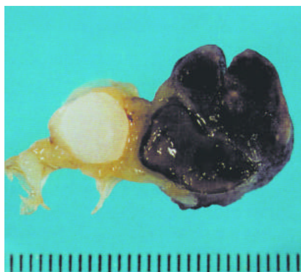
Figure 1. Macroscopic view of the ovarian tumor.

In an area the two tumor types collided. To characterize the two tumor types a panel of immunohistochemical