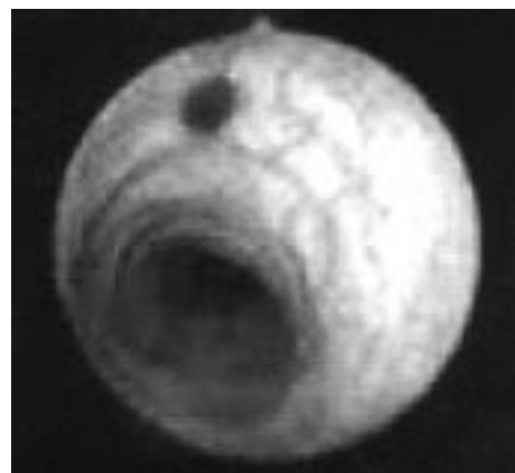
Figure 1. Bronchoscopic feature of the hemangioma in the trachea.

capillarized surface on the ventral wall of the middle trachea 2x2 mm in size ( Figure 1 ). The lesion was excised en block with biopsy forceps without significant bleeding. The histology revealed ( Figure 2 ) a fine network of thin-walled vessels. The endothelial cells (factor VIII antigen positive) showed usual shape and size with normal nuclei. Metaplastic squamous cells covered the lesion. Three months after the treatment the control bronchoscopy showed normal mucosa at the site of the excised lesion.